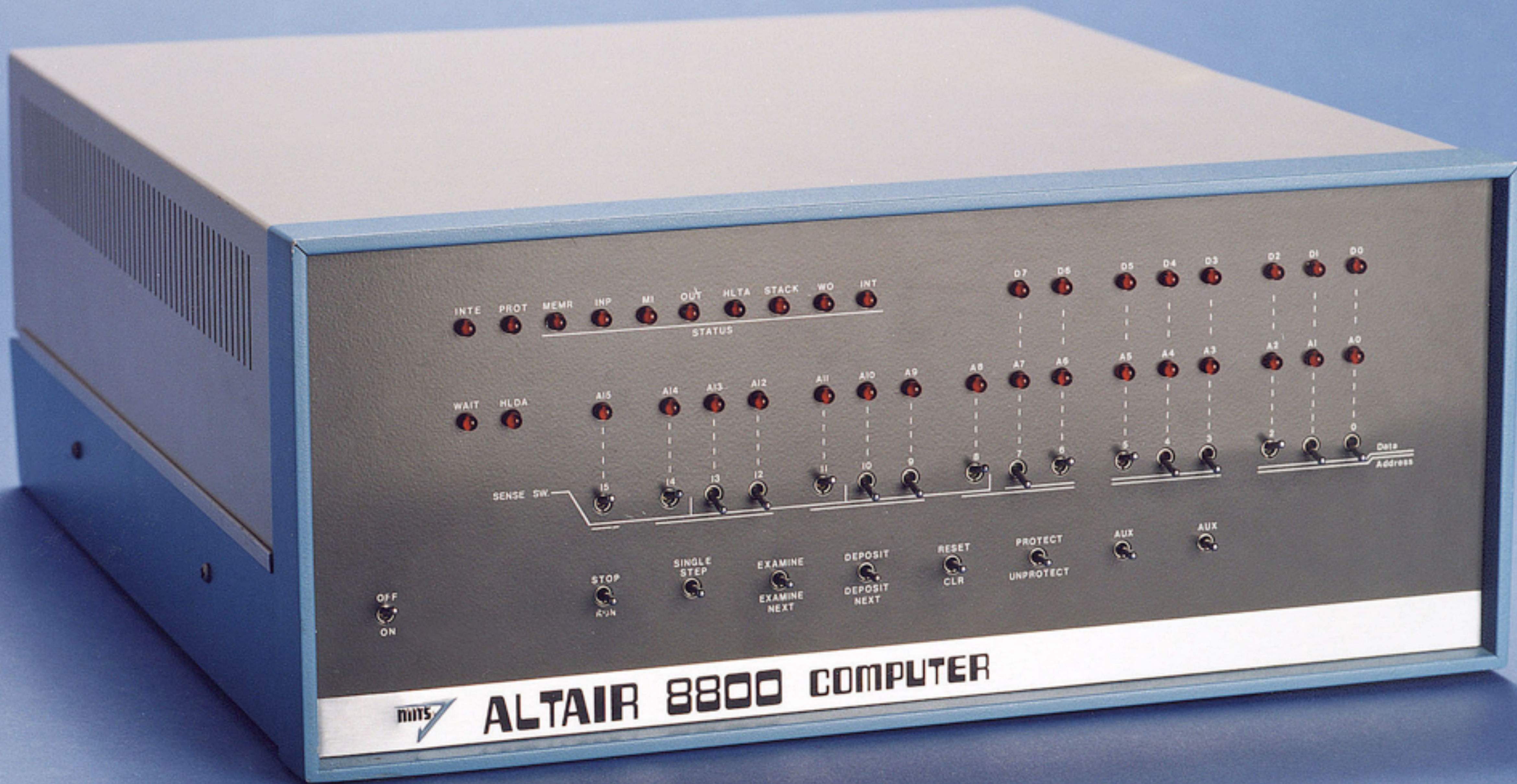
Altair: $397 (1975)