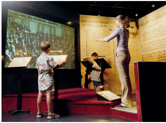
Fig. 1: Personal Orchestra, an interactive conducting exhibit in the House of Music Vienna.

optical flow fields from a given video recording, to enable the aforementioned dragging of objects to navigate a video timeline.