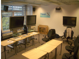
Fig. 3: The Aachen Media Space, with its flexible furniture, AudioSpace speakers and Media Boards.