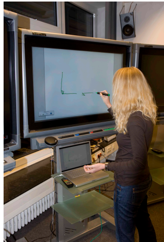
Fig. 4: A Media Board, a mobile interactive group display in the Aachen Media Space.

book) to a working prototype very easily. iStuff mobile was built on top of our earlier iStuff toolkit that enabled arbitrary input and output devices to talk to a ubicomp environment in a simple, standardized, and seamless way. iStuff mobile added off-the-shelf mobile phones as extremely versatile and “hackable” input and output devices. It also provided a graphical signal-flow-diagram style editor to connect mobile phones to inputs or effects in the ubicomp environment.