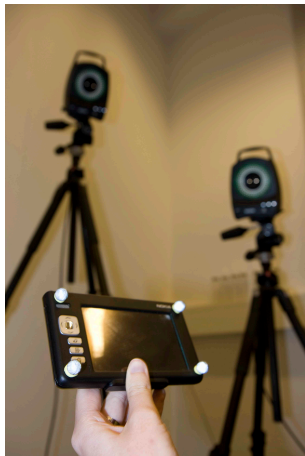
Fig. 5: VICON tracking system in the Aachen Media Space to study precise interactions with mobile devices.

disciplines in teaching and research, both at RWTH and internationally. RUF AE, for example, is an international network of research groups interested in augmented environments; partners include Electricité de Paris, Stanford, Darmstadt, CMU, Moscow, KTH, and RWTH.