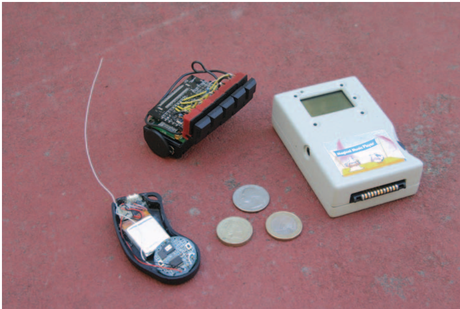
Figure 3. Handheld prototype components, including tagged presentation remote control (upper left), prototype mobile device (right), and RFID reader (bottom left). The remote control is tagged with an RFID tag (black circle on end), and the RFID reader is exposed to show its inner circuitry. (A Euro, a British Pound, and a U.S. quarter are included for scale.)

the desired application and loading a user's personal data. These technologies combine to support a model requiring "near zero" configuration—the minimum interaction necessary to perform a task. The system encapsulates an "intention" in a physical object; for example, "listen to your music on this room's sound system" could be encapsulated in a stylized box with a musical note attached to it.