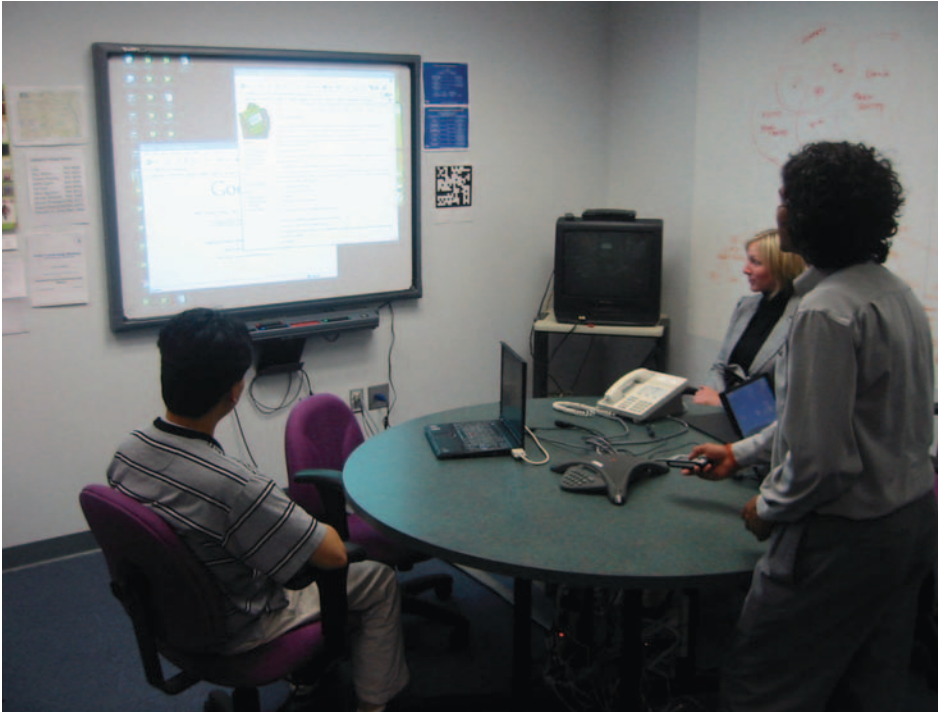
Figure 1. A mobile device can be used to import personal data into an interactive space by simply scanning a tag embedded in the space.

suiting for all tasks due to their small displays and keyboards. This observation served as the inspiration for the Personal Server Project at Intel Research in 2001 [11], a model of computing in which mobile devices wirelessly use the superior user-interface capabilities of nearby infrastructure. Interactive spaces and even collections of PCs afford a rich user experience; wirelessly blending them together with mobile devices results in the best of both worlds. Fully realizing the synergy between mobile devices and interactive spaces requires a smooth integration process not encumbered by messy cables or elaborate connection and configuration menus.