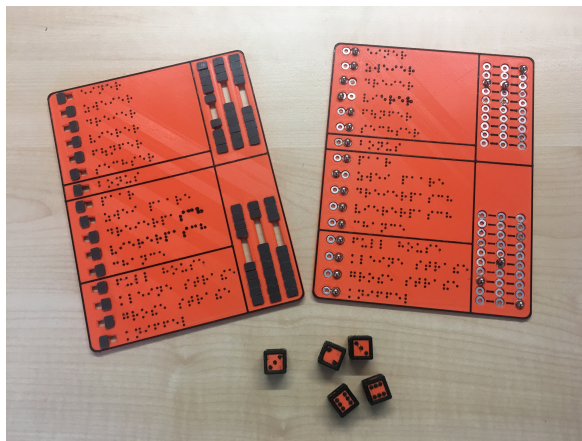
Figure 3: 3D printed score card. Complete 3D printed version (left) and improved version with magnets and washers (right).

done blind, reading the card is of course not possible for blind people. In a first approach we replaced the card with a miniature figurine of the shown building, done parametric with OpenSCAD again. Since this figure is very fragile, and scaling it up will take a lot of space for all 33 cards, we modified the design to a relief version (Fig. 2): A mirror wall cut through the middle of the building and works as stabilizing back plate, reducing also the depth to almost half the size. Only one object was not symmetric in a way that it was not possible to be able to show it correct this way.